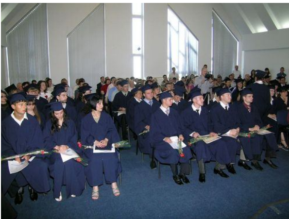
The Chapel is full of people. There are graduates and their relatives, faculty, staff of the seminary, and church leaders of local churches.