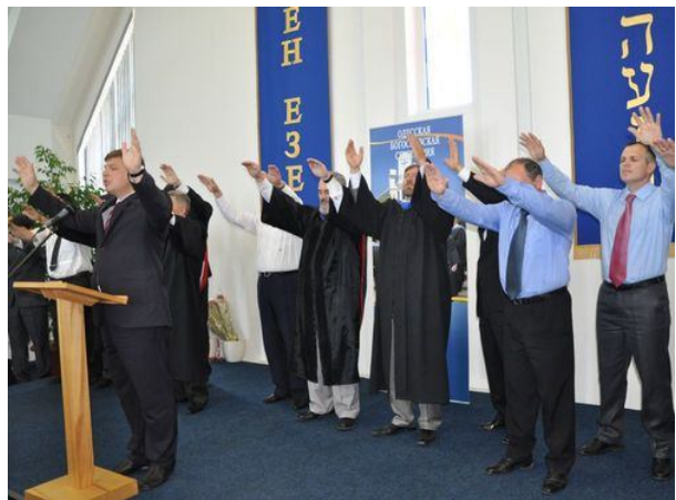
A special time of graduation ceremony is the pastors' prayer for a blessing for graduates.