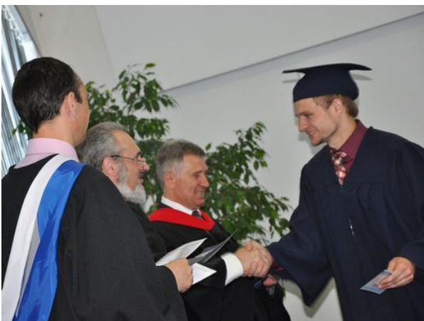
Awarding of degrees is a special time...