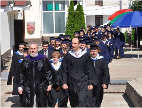
Ceremonial procession of graduates: this is the beginning of graduation ceremony at Odessa Theological Seminary.